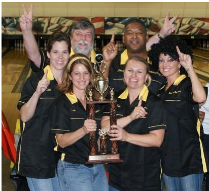
#1 Team Reliable Rollators Actual teams result on page 2